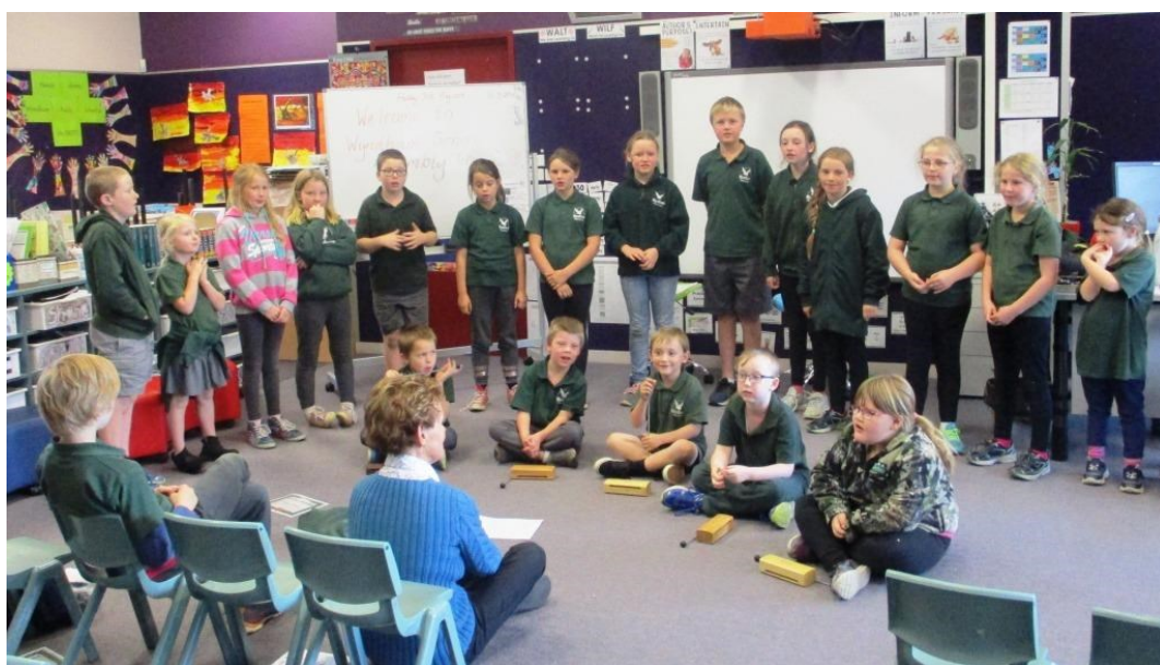
Students prepare for their performance at the Wyndham Community Concert