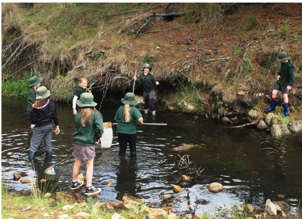
Students enjoyed the morning monitoring the health of our waterways